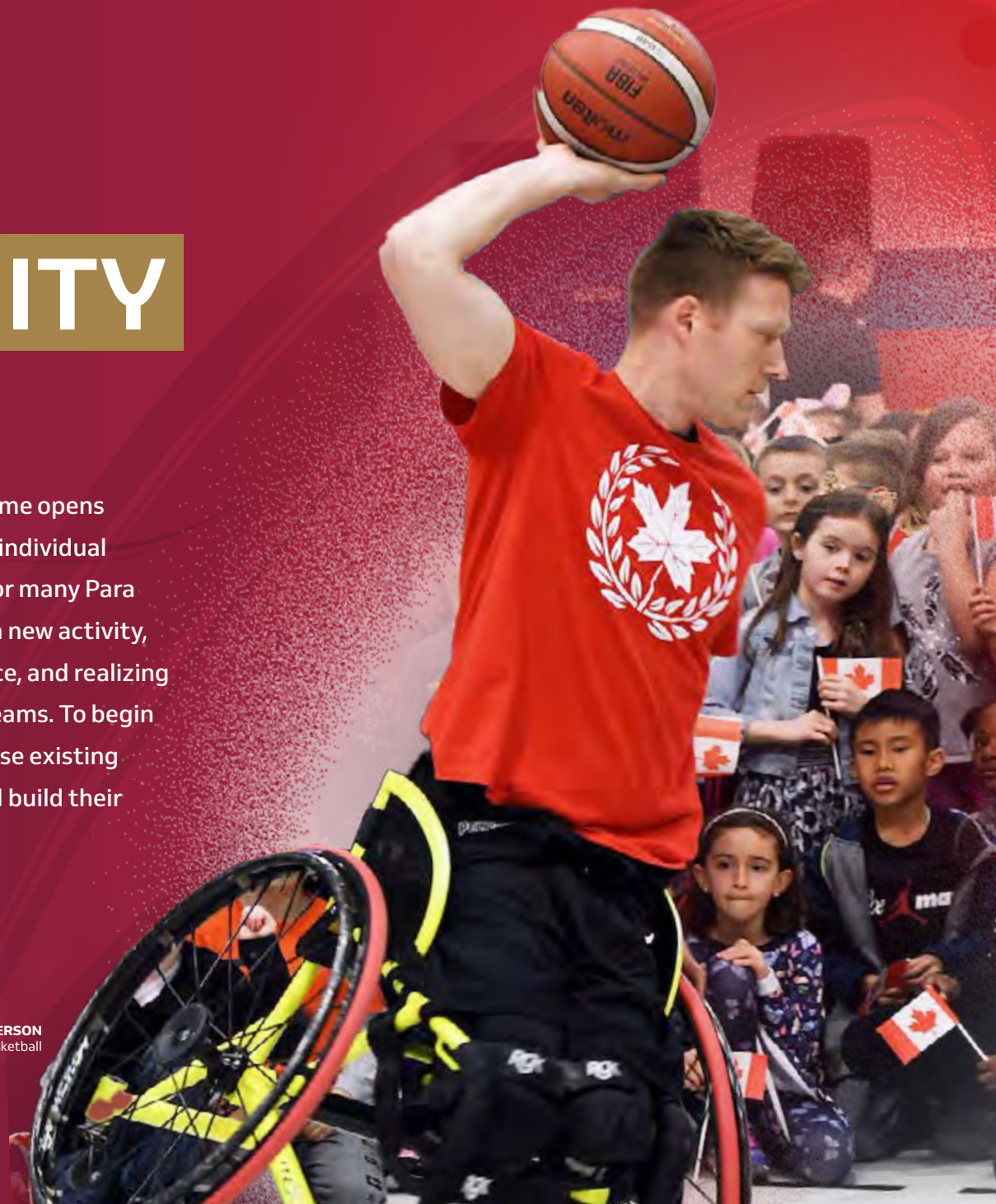
PATRICK ANDERSON Wheelchair basketball

The opportunity to try Para sport for the first time opens doors to a world of athletic possibilities that an individual with a disability may not have known existed. For many Para athletes, this represents more than just trying a new activity, it's discovering a community, building confidence, and realizing that physical differences don't limit athletic dreams. To begin this journey, however, they need to gain access to these existing programs, obtain the necessary equipment, and build their skills.